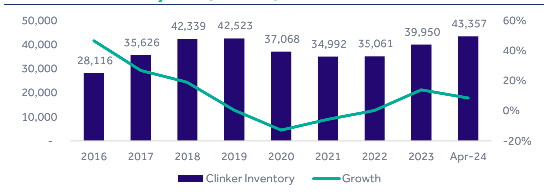
Exhibit 5: Clinker Inventory Levels (000's tons)

Clinker inventories increased by 3% M/M and 18% Y/Y.