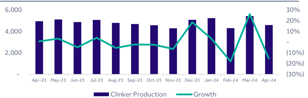
Exhibit 3: Clinker Production of Saudi Cement Sector (000's tons)

Clinker production decreased by 7% Y/Y and by 15% M/M.