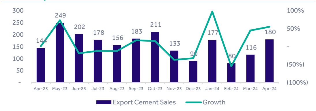
Exhibit 2: Exports of Saudi Cement Sector (000's tons)

Export sales increased Y/Y and M/M by 25% and 55%, respectively.