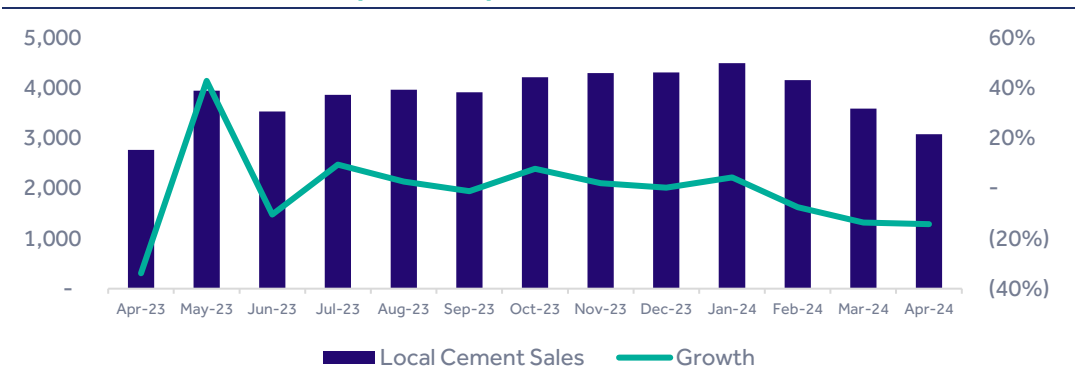
Exhibit 1: Local Cement Sales (000's tons)

In April 2024, local sales volume increased by +13% Y/Y but declined by -16% M/M for the third time since January, reaching a total of 3.1 million tons. 10 companies witnessed an increase in local sales, led by Alsafwa Cement and City Cement companies, with an annual increase of approximately 78% for both of them, while 7 companies witnessed a decrease in their sales volume, led by Northern Cement and United Cement companies by 67% and 21%, respectively. Export sales reached 180k tons, an increase of 24% Y/Y and a significant increase on a monthly basis of 55%. Export sales were led by 3 companies only, spearheaded by Saudi Cement with about 151k tons of the total.